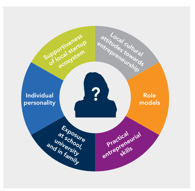
Figure 2: Factors that influence whether an individual becomes an entrepreneur

There are many factors that influence an individual's willingness or capability to be an entrepreneur (Figure 2), including individual personality and broader cultural norms. Yet many other factors—such as practical skills, access to role models, and contact with the startup economy—are shaped by a person's lifetime experiences in the education system, beginning in early childhood. Recognising this, governments are increasingly adopting policies designed to reshape their education systems into ecosystems for future entrepreneurs (Box 1).